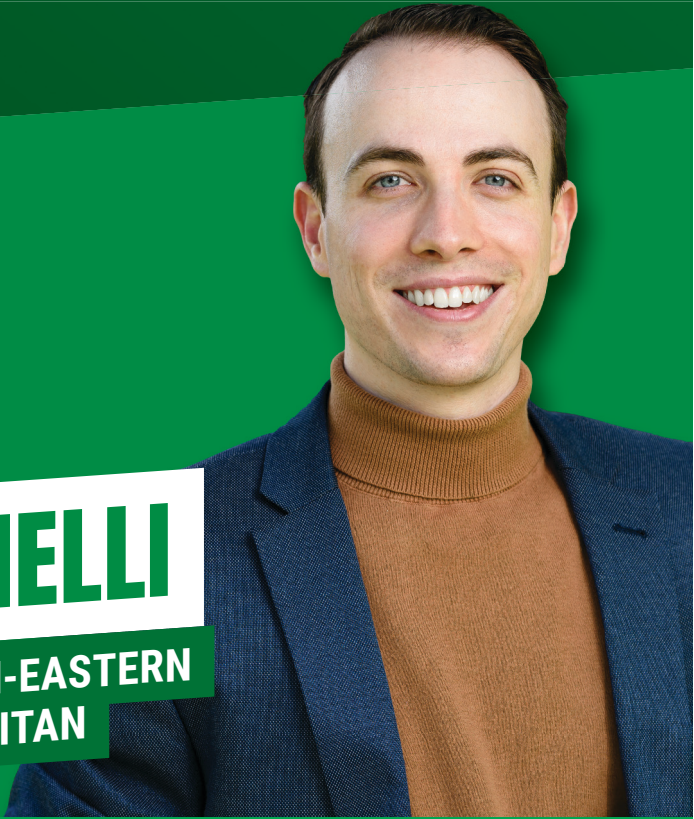
AIV PUGLIELLI FOR NORTH-EASTERN METROPOLITAN

STEP 2 Region Ballot Paper Place a number "1" in Box R. Leave all other boxes BLANK.